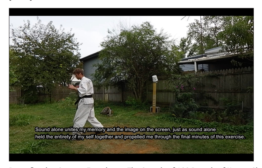
Reconfiguring Sensory Experience: The Sounds of 100 Rounds of Karate Shadowboxing