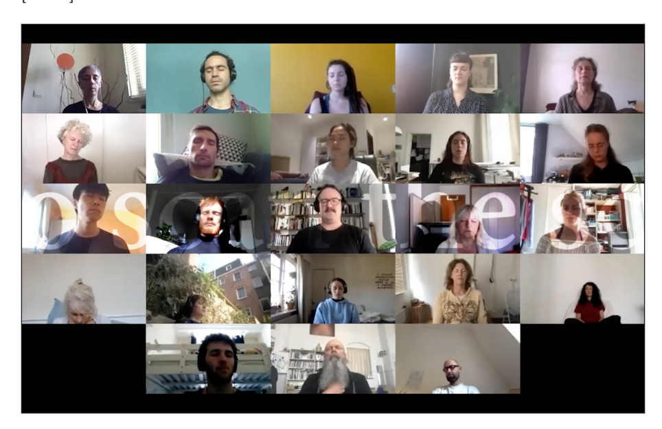
Why is the use of videoconferencing so exhausting? An analysis on the demands.